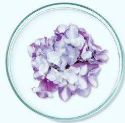
Lilac Plant Stem Cell